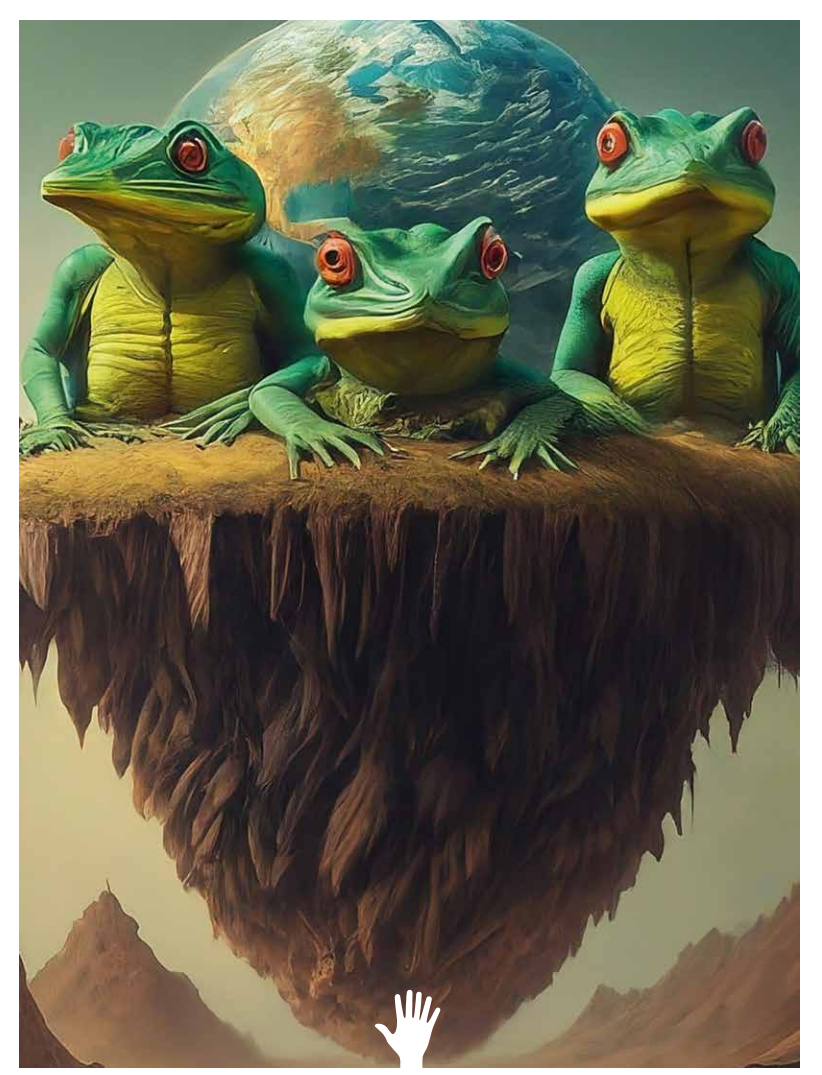
Sabine G. "Conspiracy theories" | AI Generator: Canva Prompt: Reptilians ruling over a flat Earth (translated from German)

Prompt: Create an image that highlights the drastic effects of surveillance and oppression by the state security in the GDR. Use historical photos of surveillance operations, interrogations and arrests by the Stasi. Incorporate newspaper articles that document the repression, as well as propaganda posters designed to intimidate the population. The image should dramatically and frighteningly depict the atmosphere of fear and oppression, intensified by the manipulated media landscape, in order to emphasize the importance of free media for democracy. (translated from German)